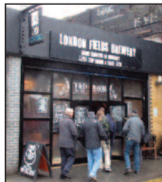
Sleet and Snow, so in we go!