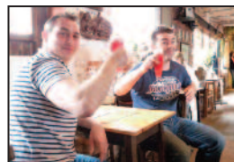
Who said fruit beer was for girls!