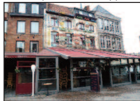
Movie Star Bar

lovely atmosphere and we found the locals chatty whilst the landlord kept us well supplied with peanuts. What better way to spend an afternoon? We weren't the only CAMRA members sampling in there either. We were sorry when we had to leave but the 'fridge was now empty of cold Houblon. At this point we must apologise to the members who I over heard complaining later that they could only get a slightly warm Houblon in there. Sorry!!!!