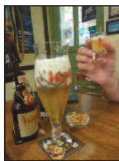
Sediment served separately

Next stop was a bar down a narrow passageway for something to eat. We both had a huge sandwich - a meal in itself. A very strange place as it had one bar sealed in glass for the smokers. It was also the only bar that poured the sedimented bits from the bottom of the beer bottle into a separate shot glass.