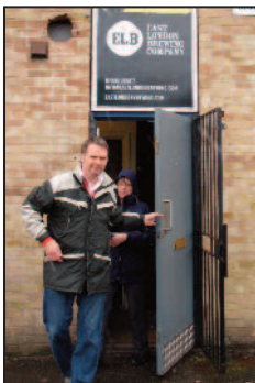
The weather's grim outside!

Then 'heigh-ho, the wind and the rain' back to the bus stop to get to London Fields brewpub, charmingly tucked under railway arches in Hackney. As is increasingly the case, this is a craft keg as well as real ale place, but none the worse for that. A charming young lady-barrister moonlighting as brewery guide showed us round the oily bits, then it was back to the bar to pitch into the wide range of delicious beers on sale whilst commuters rumbled homeward above our heads.