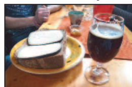
They don't stint on bread and cheese in Belgium!