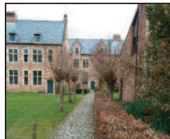
Leuven - Groot Begijnhof

Breakfast in the morning was the usual continental selection of breads, cheese and fruit, with meats for the non-vegetarians. Note to self ... bring teabags next time. They really don't do a good cup of tea in Belgium! We then had a few hours to explore the town. First was the pretty Groot Begijnhof van Leuven - an old community for unmarried women dating back to the early 13 th century but now owned by the university. We then we followed the river as it wound its way among the streets.