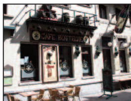
't Botteltje Ostend

Then time to get back on the coach and yes ..... someone was late again!! We could have seen the end of the race!!!! The last stop was Ostend, with a large contingent heading for the ever popular stop at 't Botteltje. Then home to Milton Keynes.