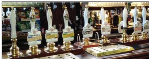
A small part of the Brodie's beersselection

From there, we took the short bus journey to the William IV in Leyton which is the home of Brodie's. Some of us thought we had died and gone to Heaven when we walked in - sixteen beers were on tap, including many one-off specials, and all at just £1.99 a pint! This pub's also a great place to stay, with rooms from just £45 a night.