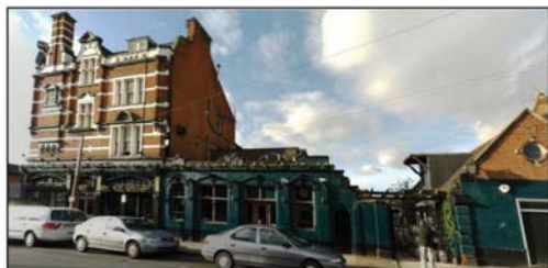
William IV and Brodie's Brewery

They took us first to Ye Olde Rose and Crown in Walthamstow; East London branch's Pub of the Year in 2011. This traditional pub has a good choice of real ales, and on that day had four on tap including Titanic Steam Whistle and Orkney Red McGregor. It also has a theatre, which is unusual for any pub outside the West End, and an original mosaic floor which depicts the Rose and the Crown.